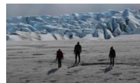
ICE HIKE GREY GLACIER