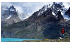
TREKKING VALLEYS OF THE W

Creating great experiences since 1996 in Patagonia