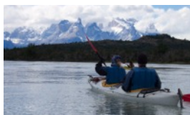
KAYAK SERRANO RIVER